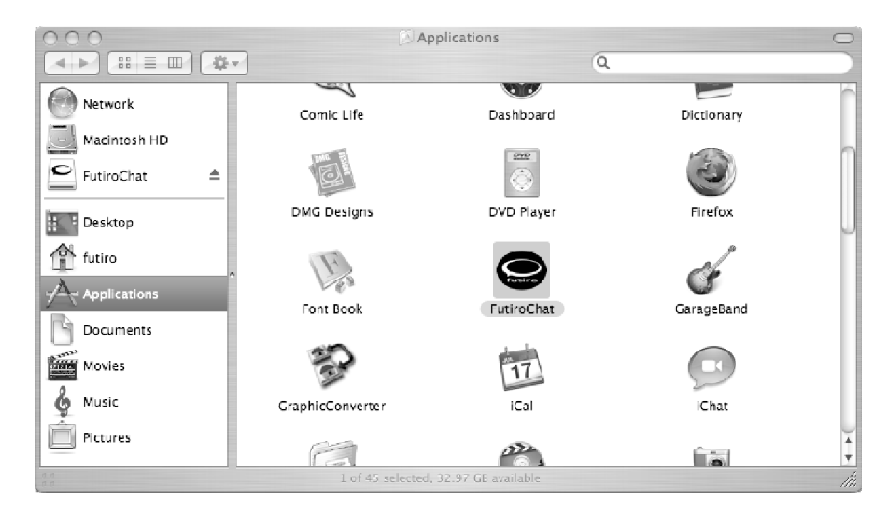
Figure 2.4 – Applications Folder

To run the Futiro software, locate the FutiroChat icon in the Applications folder (Figure 2.4) and double-click on it.